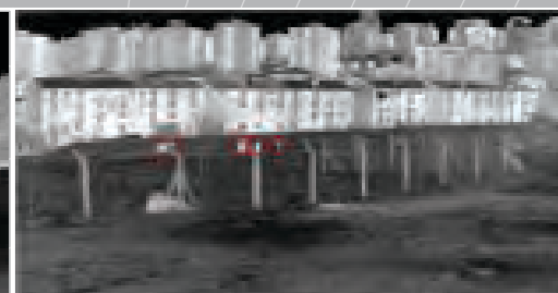
• Border security